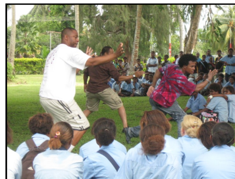
OCBF team ministering a dance at Tusbab Secondary School in Madang town.

Some villages walked great distances to hear the OCBF team minister.