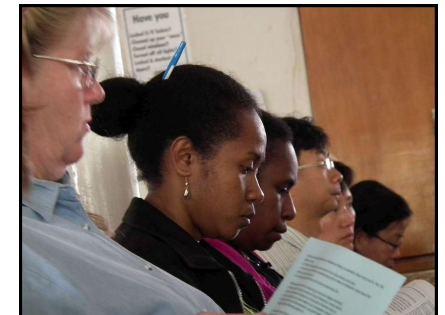
SIL PNG Conference participants

SIL is a key partner with BTA in the Bible translation ministry. The changes that SIL is making in PNG, and globally, will impact BTA for the betterment of Bible translation work across the nation.