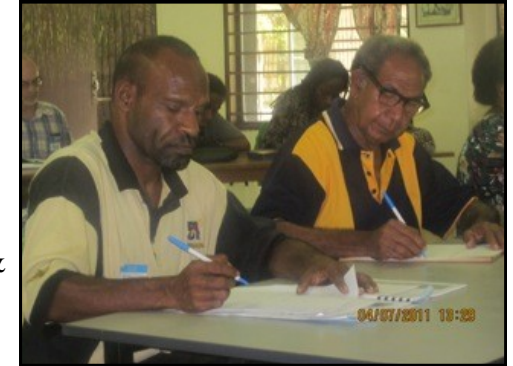
Participants at the BAM Training in Port Moresby.

Participants were taught how to start a business from the planning stage to the customer service stage, including budget cost for keeping the business running and different ideas of ministering to clients and customers. Success comes by having God as the owner of the business and the manager as the