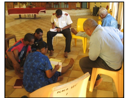
Participants in a group discussion at Kalo United Church, Central Province.

The key to the success of this workshop was the full involvement and support of the entire Kalo community. Plans are now in place to select a number of the people to attend further translation training in the near future.