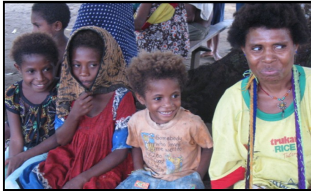
Ogea children with a parent, Garim village, Madang

A number of BTA language workers had to leave their language work to seek other ways to get money to pay school fees for their children. We thank the Lord for BTA's partners who've come to the aid of some of these children. This helped to ease some of the load off their parents.