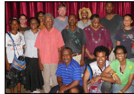
OCBF team with BTA translators at Nobonob

OAK CLIFF Bible Fellowship (OCBF) from Dallas, Texas USA sent its fifth short-term mission team to Madang Province to encourage local translators in three language areas and while there do evangelical outreach in Madang town.